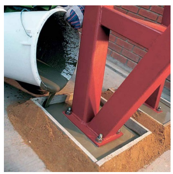
Two Component Epoxy Resin Grout - ERG™200